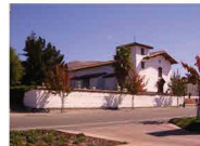
Old Mission San Jose

9) Old Mission San Jose missionsanjose.org 43300 Mission Blvd., Fremont, CA 94539 (510) 657-1797 Open daily 10 am - 5 pm. Founded in 1797 as 14th of 21 Spanish Missions. Museum features artifacts of Mission period and Ohlone Indians.