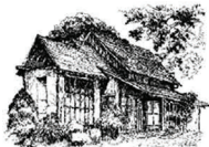
Olive Hyde Art Center

3) The Patterson House fremont.gov/pattersonhouse 34600 Ardenwood Blvd., Fremont, CA 94555 (510) 791-4196 Tours Thurs-Sun April-Dec. The City of Fremont's 16 room Victorian-era Queen Anne mansion is seated on 205 acres. Filled with original furnishings operating as a museum offering events and programming for the community.